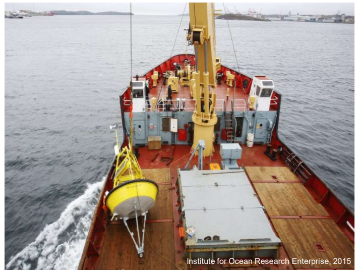
Institute for Ocean Research Enterprise, 2015

Ship's Navigation Officers are responsible for the safety of the ship, your crew and any other person on board the vessel. They may plan and execute safe passage using navigational aids and determine the geographical position ships using navigational instruments, maps, and charts. They may also direct and oversee the loading and unloading of cargo; and record on the ship's log the vessel's progress, crew's activities, and weather and sea conditions.